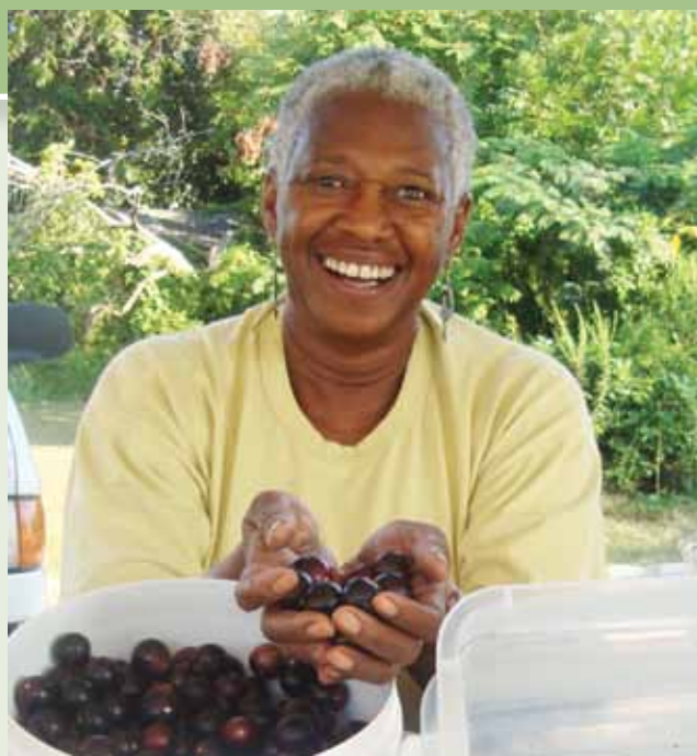
Selected by National Women in Ag Association

Her future plans not only include selling blueberries, but to restore the historical model farm site that was established in the late 1970s as a demonstration family farm.